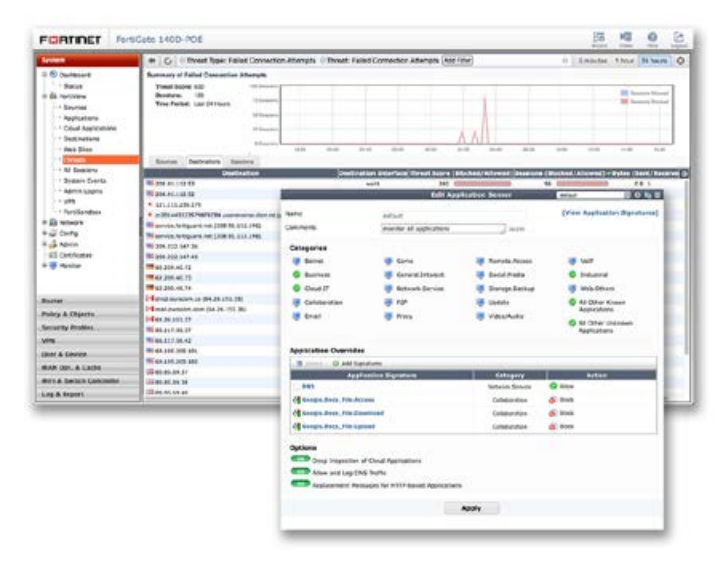
FortiOS Managment UI — FortiView and Application Control Panel