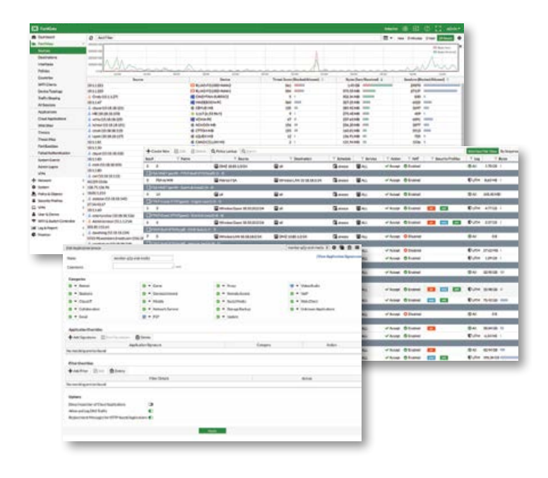
FortiView, Policy Table and Application Control Panel