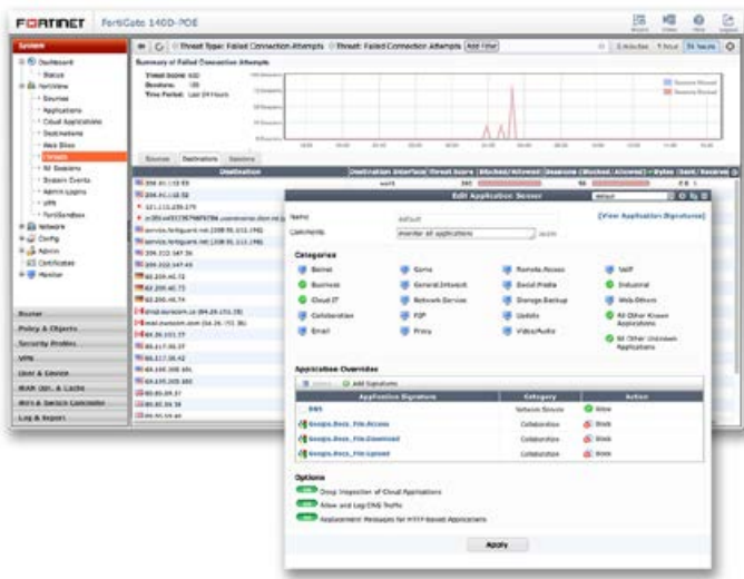
FortiOS Management UI — FortiView and Application Control Panel