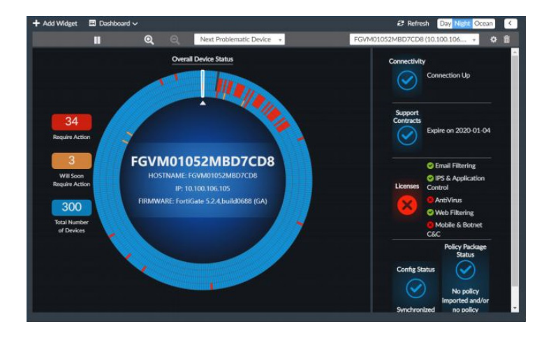
Figure 2: NOC-SOC Device Status Dashboard

Collectively configure the device settings, objects and policies across your network from a single user interface. The VPN manager simplifies the deployment and allows centrallyprovisioned VPN community and monitoring of VPN connections on Google Map. FortiAP Manager allows configuring, deploying and monitoring FortiAPs from a single console with Google Map view. The FortiClient Manager allows centralized configuration, deployment, and monitoring of FortiClients.