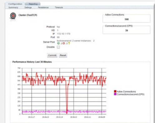
Sample of a TCP Cluster Configuration Summary Screen