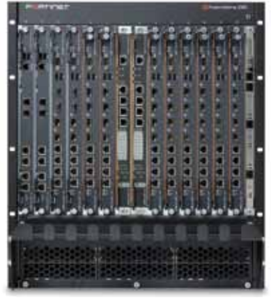
FortiGate-5140B Security System