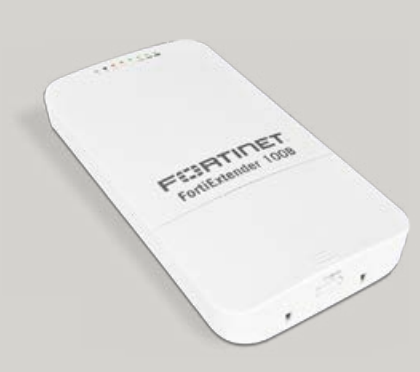
FortiExtender<sup>™</sup> 3G/4G LTE Wireless WAN Extenders